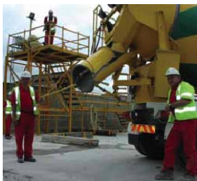
Chute handle for truck mixers