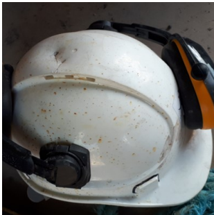
Hard hat with dent along back near centre

This design may exist on conveyor systems on other sites.