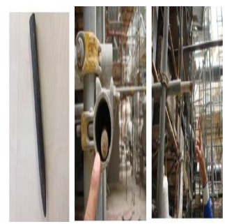
Tool & Location

The investigation is ongoing however it became apparent this is not a standalone incident and although this was raised several years ago with controls for elimination, the incident has occurred at least once previously. A full review of controls is being completed.