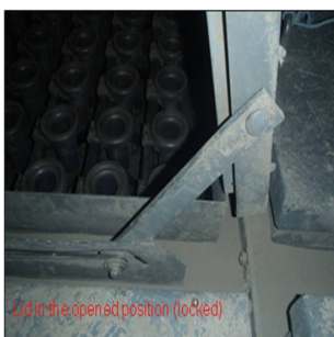
Lid in Locked Open Position

The lids have a sliding locking mechanism which prevents them from closing once this mechanism has locked into the lower runner position. The most likely cause of the incident is that the locking mechanism had not fully engaged, allowing the lid to drop on to the IP, when it was inadvertently knocked. As a result of the incident the contractor lost the ends of the two fingers down to the first knuckle.