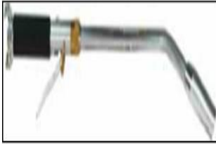
Alternative hose nozzle with trigger Alternative