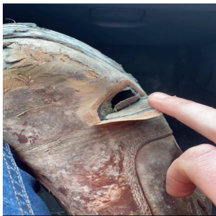
Damage to the boot above toe cap

A trained operative was changing a cutting edge on a loading shovel bucket. The old edge had been removed and the base edge cleaned with a scraper (as per safe operating practice). Before fitting the new edge, the operative noticed some dirt remaining on the base edge and raised his foot to rub it off. The base edge was worn sharp like a razor and sliced through his safety boot, above the steel toecap and sliced the operative's foot. The operative required a trip to A&E and the wound required stitching. This resulted in a LOST TIME INJURY (LTI) as the operative was required to rest his foot to ease pressure on the stitches.