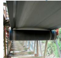
Image of roller before