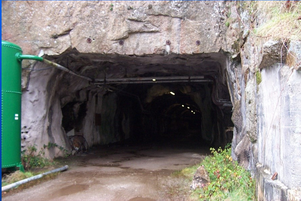
Holman's Test Mine