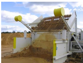
Self-cleaning hopper grid