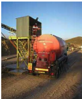
Safety committee OE a re-evaluation