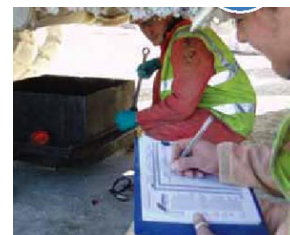
Safety committee OE a re-evaluation