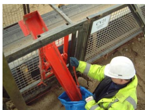
Mechanical scoop belt-sampler