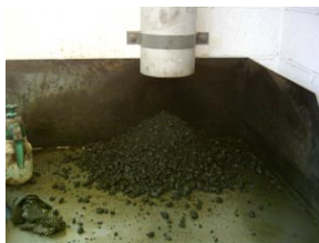
Improvements to the sampling arm