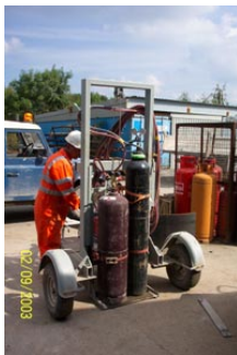
Transporter for gas bottles