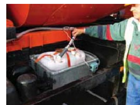
Pump system for additives