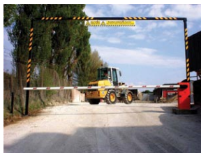
Vehicle segregation automated