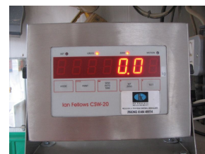
The Control System