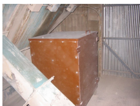
The new unit