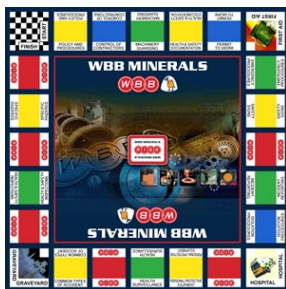
Video to support induction programme