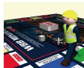
Video to support induction programme