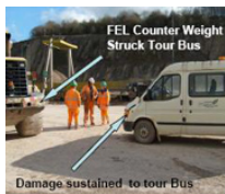
Damage sustained to tour bus