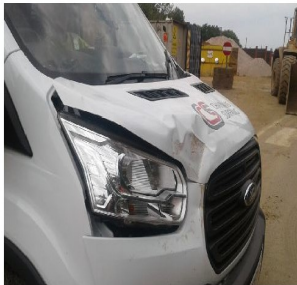
Collect Customer Van