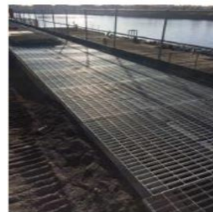
Grating secured - note overlap