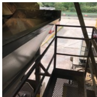
Access platform from which other employee observed