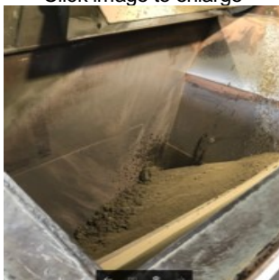
Hopper the employee entered