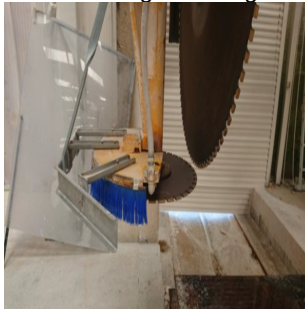
Image with new guard fitted