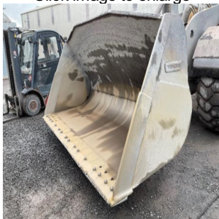
Before - Bucket showing razor sharp edge