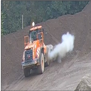
Tyre exploding on video

No defects were reported when the operator carried out his daily pre-start safety checks.