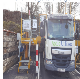
New adjustable platform