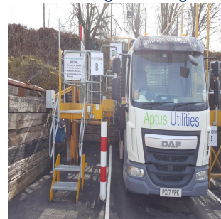
New adjustable platform