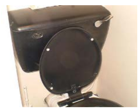
Toilet cistern containins asbestos