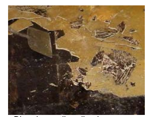
Bituminous tile adhesive