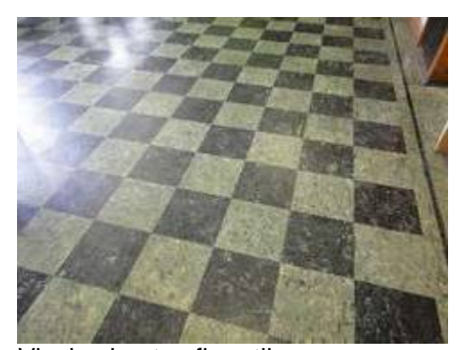
Vinyl asbestos floor tiles