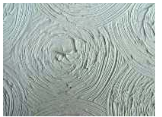
Artex textured plaster containing asbestos