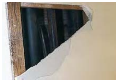
Asbestos Insulating Board (AIB)