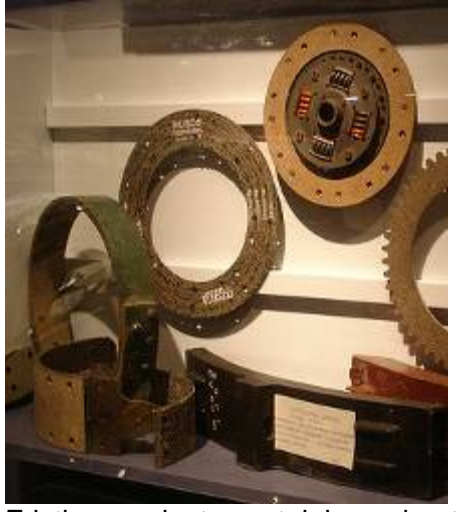
Friction products containing asbestos