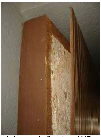
Asbestos in fire door (AIB may also be used)