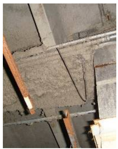
Sprayed asbestos fire-proofing and/or insulation