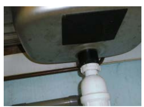
Bitumen-asbestos sink pad