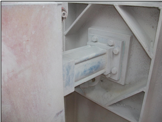
Photograph 3 (before)

Underneath the shroud (circled) is the hydraulic cylinder connection. To disconnect required confined space entry into discharge tables casing