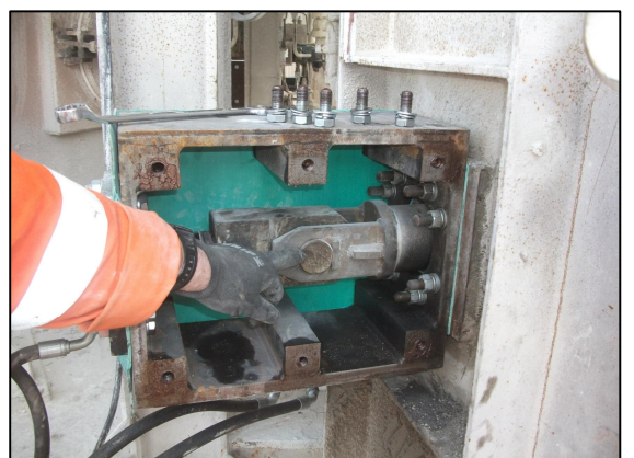
Photograph 6 (after)

Hydraulic cylinder connection, section arrowed has also been extended to allow the hydraulic cylinder to be disconnected without any confined space entry