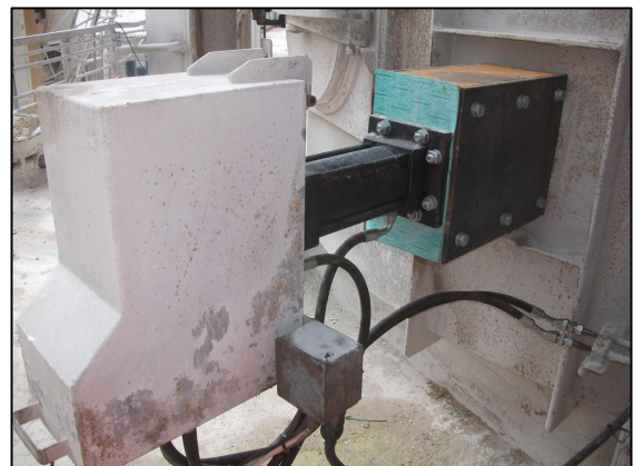
Photograph 4 (after)

Showing hydraulic cylinders bolted directly to the discharge table casing pre-modification