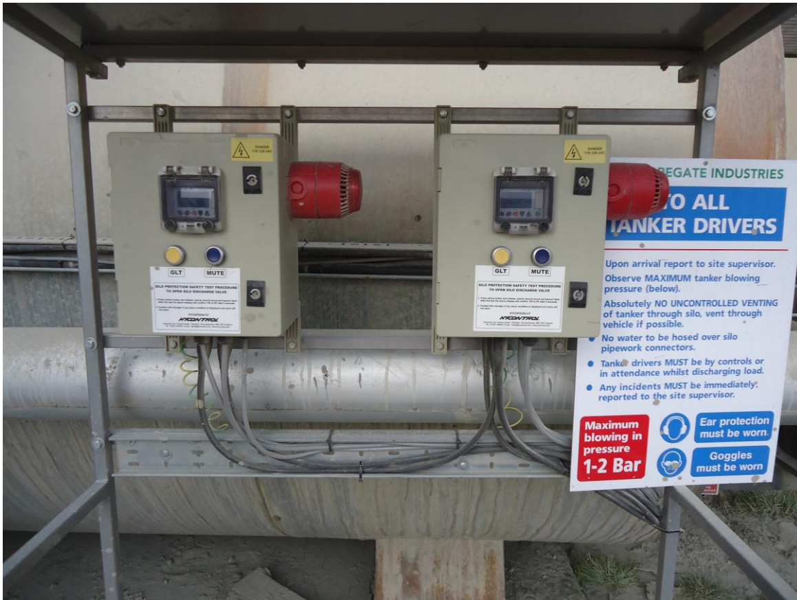
Fill Point Panels