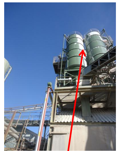
Silo's high up on the plant with evidence of lime powder discharge down