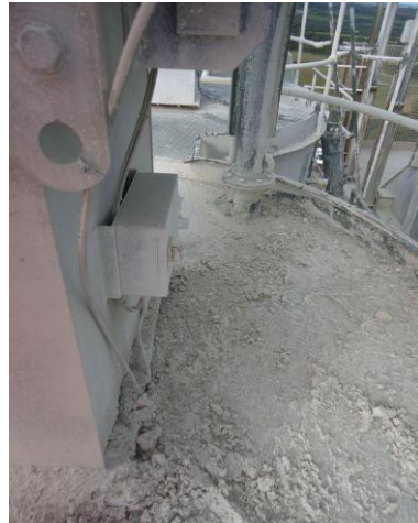
Top of the silo with evidence of lime powder