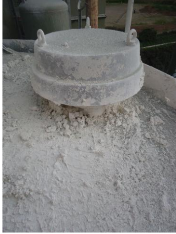
Smaller PRV with evidence of lime powder